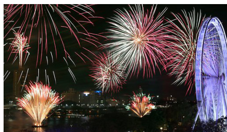
New Year Fireworks, South Bank

Source: https://visit.brisbane.qld.au/whats-on/inner-city/eat-and-drink-events/the-lord-mayors-new-years-eve-fireworks-at-south-bank-b363