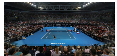
Brisbane International 2026, Tennyson

Source: https://www.tennis.com.au/brisbane-international/tournament