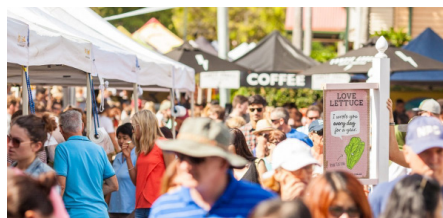
Milton Markets, Milton

Source: https://miltontoday.com.au/new-milton-markets-brighten-up-sunday-mornings/