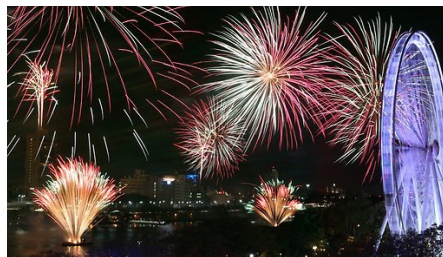
New Year Fireworks, South Bank

Source: https://visit.brisbane.qld.au/whats-on/inner-city/eat-and-drink-events/the-lord-mayors-new-years-eve-fireworks-at-south-bank-b363