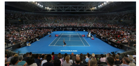
Brisbane International 2026, Tennyson