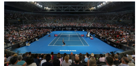
Brisbane International 2026, Tennyson

Source: https://www.tennis.com.au/brisbane-international/tournament