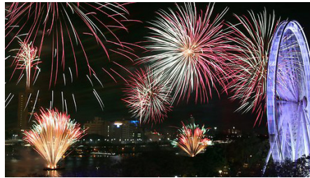
New Year Fireworks, South Bank

Source: https://visit.brisbane.qld.au/whats-on/inner-city/eat-and-drink-events/the-lord-mayors-new-years-eve-fireworks-at-south-bank-b363