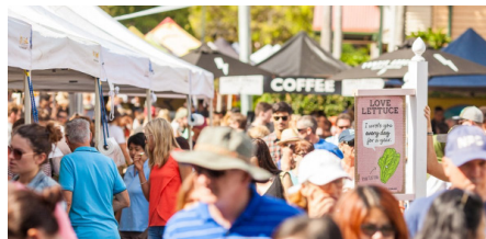
Milton Markets, Milton

Source: https://miltontoday.com.au/new-milton-markets-brighten-up-sunday-mornings/