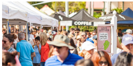
Milton Markets, Milton

Source: https://miltontoday.com.au/new-milton-markets-brighten-up-sunday-mornings/