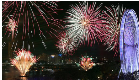
New Year Fireworks, South Bank

Source: https://visit.brisbane.qld.au/whats-on/inner-city/eat-and-drink-events/the-lord-mayors-new-years-eve-fireworks-at-south-bank-b363