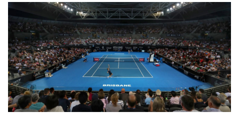
Brisbane International 2026, Tennyson

Source: https://www.tennis.com.au/brisbane-international/tournament