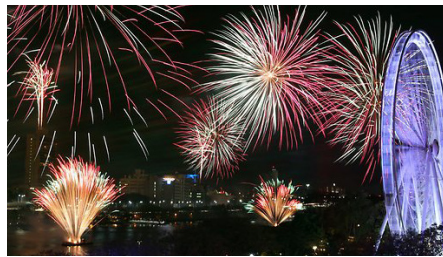
New Year Fireworks, South Bank

Source: https://visit.brisbane.qld.au/whats-on/inner-city/eat-and-drink-events/the-lord-mayors-new-years-eve-fireworks-at-south-bank-b363