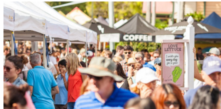
Milton Markets, Milton

Source: https://miltontoday.com.au/new-milton-markets-brighten-up-sunday-mornings/