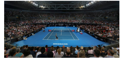
Brisbane International 2026, Tennyson

Source: https://www.tennis.com.au/brisbane-international/tournament