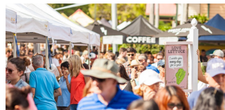
Milton Markets, Milton

Source: https://miltontoday.com.au/new-milton-markets-brighten-up-sunday-mornings/