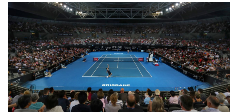
Brisbane International 2026, Tennyson

Source: https://www.tennis.com.au/brisbane-international/tournament