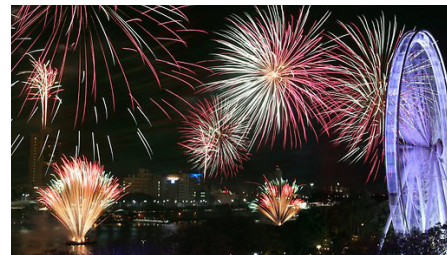
New Year Fireworks, South Bank

Source: https://visit.brisbane.qld.au/whats-on/inner-city/eat-and-drink-events/the-lord-mayors-new-years-eve-fireworks-at-south-bank-b363