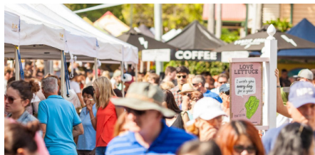
Milton Markets, Milton

Source: https://miltontoday.com.au/new-milton-markets-brighten-up-sunday-mornings/