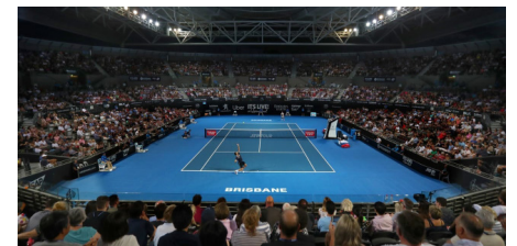
Brisbane International 2026, Tennyson

Source: https://www.tennis.com.au/brisbane-international/tournament