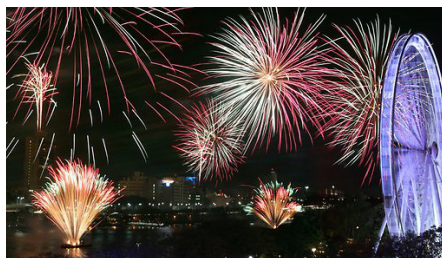
New Year Fireworks, South Bank

Source: https://visit.brisbane.qld.au/whats-on/inner-city/eat-and-drink-events/the-lord-mayors-new-years-eve-fireworks-at-south-bank-b363