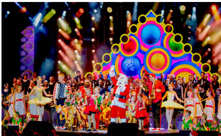
Lord Mayor's Christmas Carols