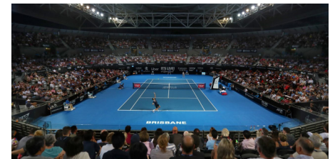
Brisbane International 2026, Tennyson

Source: https://www.tennis.com.au/brisbane-international/tournament