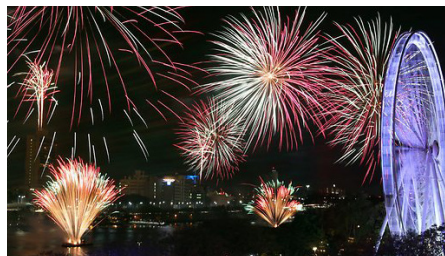
New Year Fireworks, South Bank

Source: https://visit.brisbane.qld.au/whats-on/inner-city/eat-and-drink-events/the-lord-mayors-new-years-eve-fireworks-at-south-bank-b363