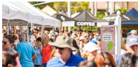
Milton Markets, Milton

Source: https://miltontoday.com.au/new-milton-markets-brighten-up-sunday-mornings/