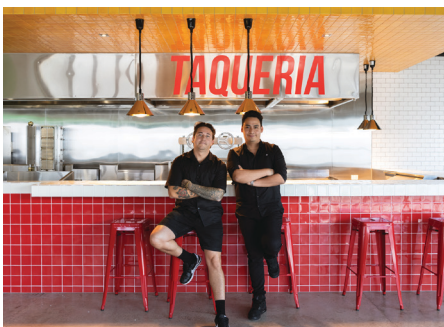
Opening of the new Cartel Del Taco in New Farm