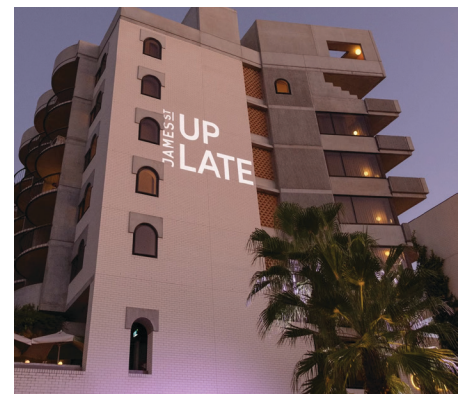
The Calile Hotel with James St Up Late