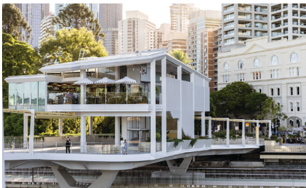
Brand New Restaurant, Stilts

Source: https://www.indailyqld.com.au/theweekendedition-brisbane/food-drink/2025/02/26/stilts-brisbane-city