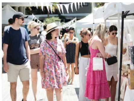
Easter Market Stalls at Gasworks