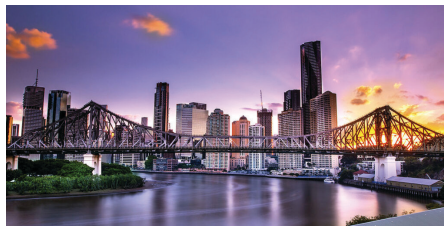
Brisbane City River Story Bridge