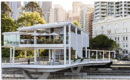
Brand New Restaurant, Stilts

Source: https://www.indailyqld.com.au/theweekendedition-brisbane/food-drink/2025/02/26/stilts-brisbane-city