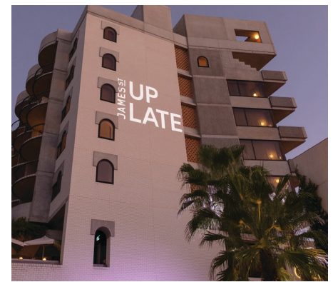
The Calile Hotel with James St Up Late