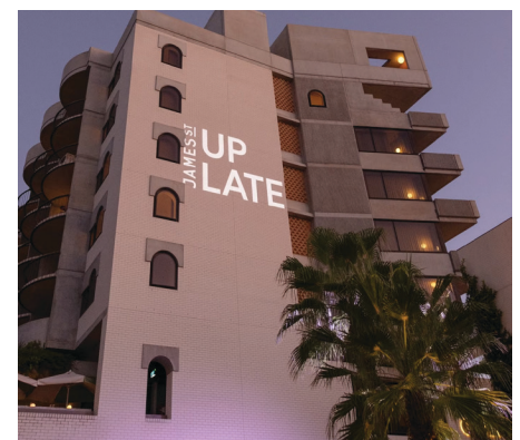
The Calile Hotel with James St Up Late