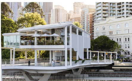
Brand New Restaurant, Stilts

Source: https://www.indailyqld.com.au/theweekendedition-brisbane/food-drink/2025/02/26/stilts-brisbane-city