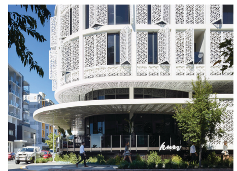
Thank you, Kurv Management.

Thank you for your cooperation with continued works and help in keeping our building a great place to live. If you have any questions, feel free